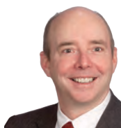
DOPKINS & CO. LLP

Without an effective support system, the business and our children will both face disappointment and eventual fail-