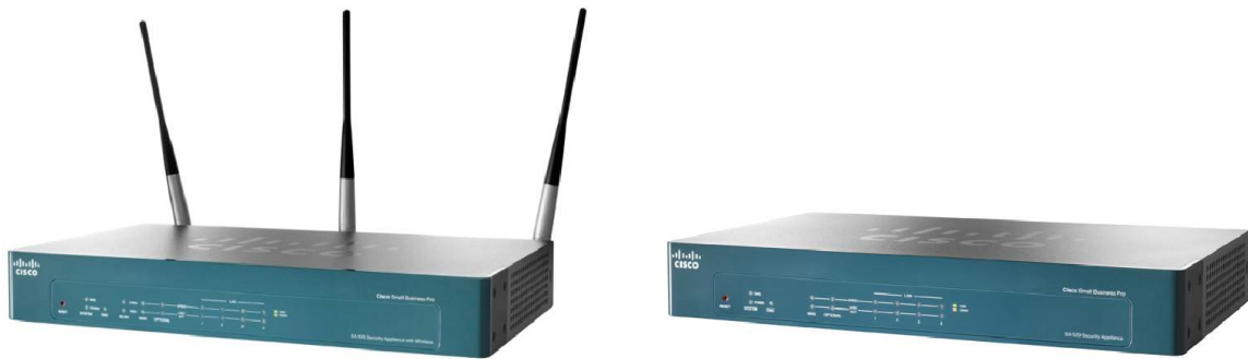
Figure 3. Cisco SA 500 Series Security Appliances, the SA 520W and the SA 520

Figure 3 shows the Cisco SA 500 Series Security Appliance with and without wireless connectivity.