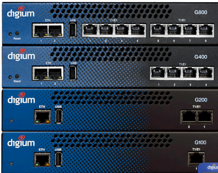
The Digium family of gateways

Deployed in any application, Digium gateways will provide proven reliability for a fraction of the cost of other gateway platforms on the market. The easy to setup gateways and API will reduce administration and troubleshooting costs for any organization, from a small business to a large enterprise.