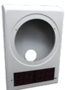
011153/011154 Wall Mount Clock Kit