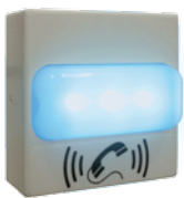
011288 Auxiliary RGB Strobe Kit