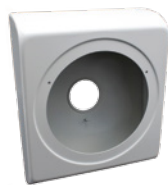
011151/011152 Speaker Wall Mount