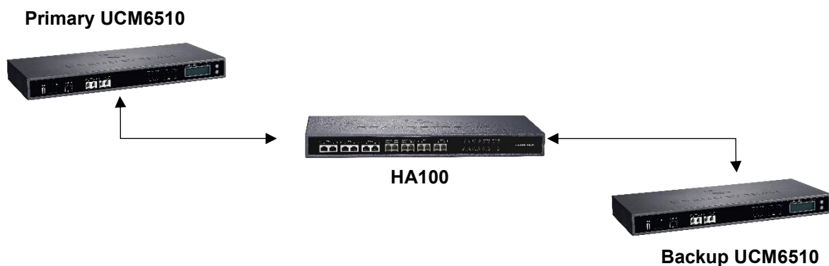
Figure 1: High Availability

Powered by an advanced hardware platform and revolutionary software functionalities, the connection between the UCM6510 and HA100 offers a breakthrough turnkey solution for converged voice, video, data, fax, security surveillance, and mobility applications out of the box without any extra license fees or recurring costs.