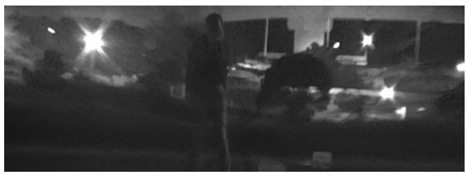
Without Smart IR II