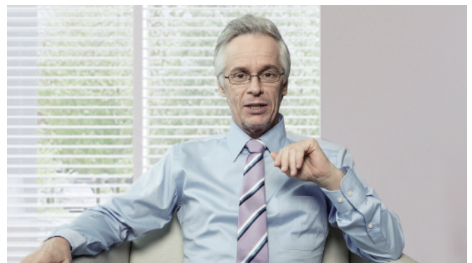
Yealink VCS under 8% packet loss