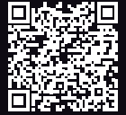
SWM280 360° VIEW